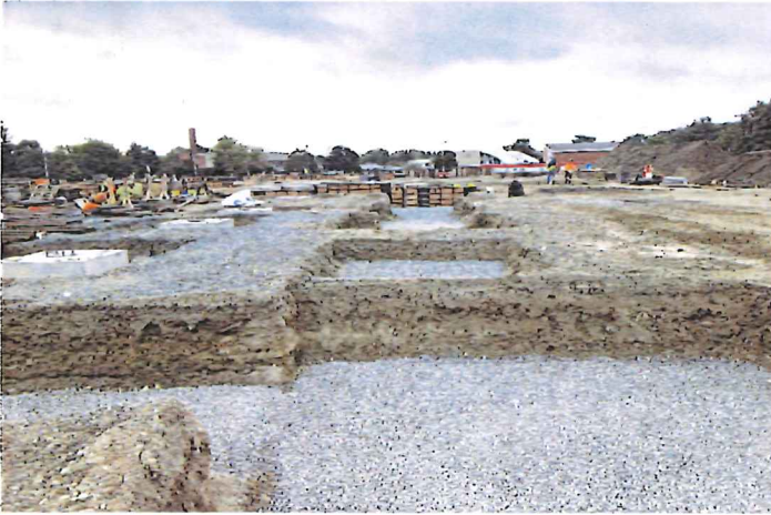
10/14/18 – Infiltration System #1 Drone Photo