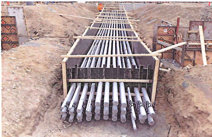
October 2018 – Duct Bank Install & Forms