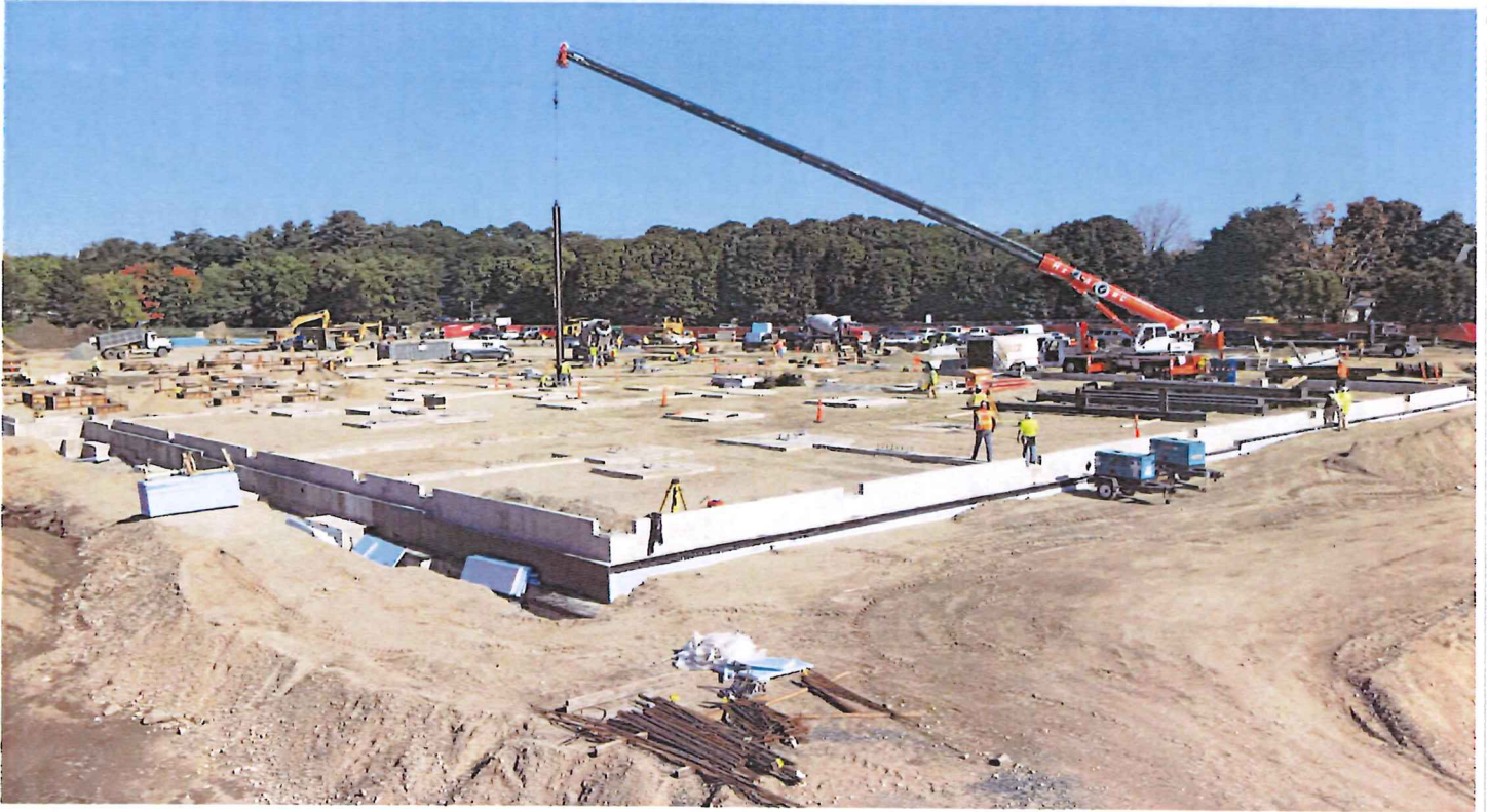
10/17/18 – Drone Photo after First Day of Steel Erection