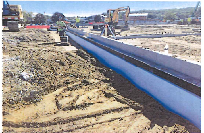
10/17/18 – Infiltration System #1 Backfill