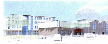
Middle-High School Grades 6 – 12 (New School)

This initiative would create a 6-12 Middle-High School; the current Belmonte Middle School would be established as an Upper Elementary School for grades 3-5; and the Veterans Memorial Elementary School would become a Lower Elementary School for pre-K to grade 2. Endorsing this vision and the school district's plan will transform the way education is valued within this community. Most importantly, it will provide equal, equitable opportunities for students to access educational resources and reach their highest potential.