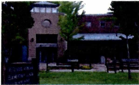
Lower Elementary Pre K - Grade 2 (Veterans Memorial School)

This S&P AA+ ranking, which is the highest in Saugus' history, signifies the Town's credit worthiness and that the Town has a very strong capacity to meet its financial commitments. The sound financial practices of the Board of Selectmen, Finance Committee, and Town Meeting, as well as, Town department heads and employees, has contributed to the Town's consistent annual free cash and significant stabilization reserves, ultimately resulting in the Town's vastly improved bond rating.