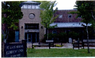
Lower Elementary Pre K - Grade 2 (Veterans Memorial School)

At a Town-wide election on June 20, 2017, the residents of Saugus will have an opportunity to support and invest in a new 21 st century education plan and Middle-High School district-wide facility that will continue to prioritize education. Supporting this initiative will change the way education is delivered and help the school district achieve its goal to become a top-rated, level 1 school district in Massachusetts - our Town deserves and needs higher expectations and standards for our children and community.