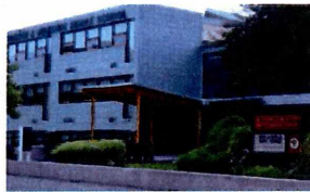
Upper Elementary Grades 3 - 5 (Belmonte School)