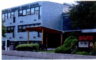
Upper Elementary Grades 3 - 5 (Belmonte School)